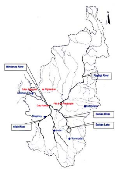
Mindanao River Basin