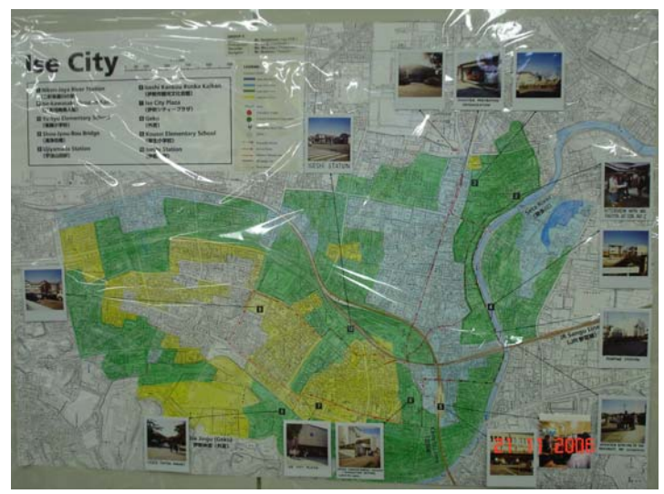
HAZARD MAP ON ISE CITY